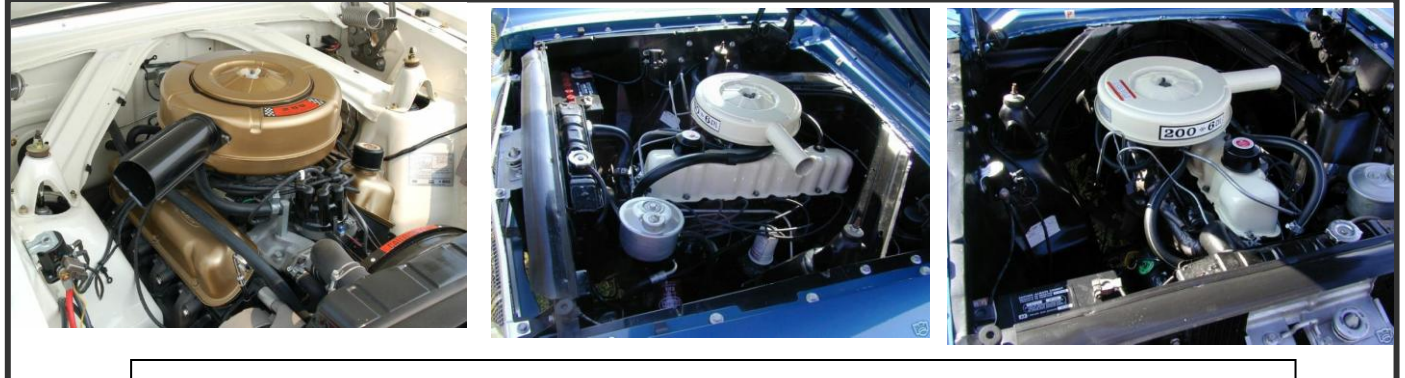
1964 289-V8 in Bronze Gold and all new 200 six cylinder in Ivory White paint scheme.

The new 200 cubic inch six was given an ivory white valve cover and air cleaner. The Ditzler Paint code for both is 81052. The 289 V8 was given Gold Bronze valve covers and air cleaner for all models except the Cyclone. As with the 260 V8s the snorkel and heat collector are painted Semi Gloss Black. The Ditzler paint code for the 289 V8 valve covers and air cleaner is 22362. In January 1964 a sporty Comet Cyclone model was added to the model line-up. The Cyclones were given its own unique Argent paint scheme for its air cleaner. The Ditzler Paint code for this engine is DEE-45 just like the 170 six cylinder. Cyclone 289 4v engine were also given an optional engine dress-up kit which included chrome valve covers, dipstick, and air cleaner top cover as standard. Below are some examples from the 1964 model year.