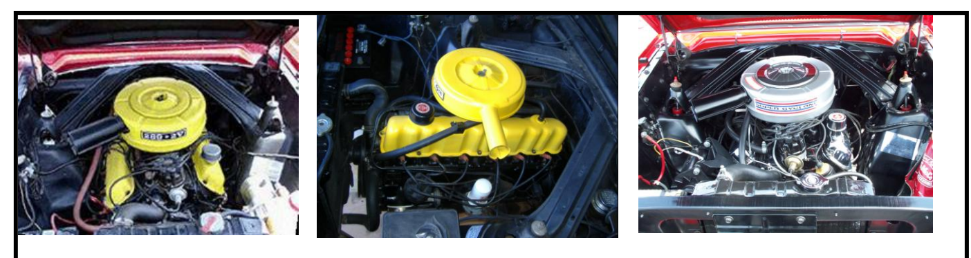
Above are examples of the 1965 Comet and Cyclone Engines. Notice the Cyclone far right is painted In its unique Argent paint scheme.

were from the 64 model year.. The Cyclones for 1965 were once again given its own unique Argent paint scheme for its air cleaner. The Ditzler Paint code for this engine again was DEE-45 just like the 1964 models. Cyclone Super 289 engines were also given the optional engine dress-up kit as standard and including chrome valve covers, dipstick, and air cleaner top cover. Below are some examples for the 1965 model year.